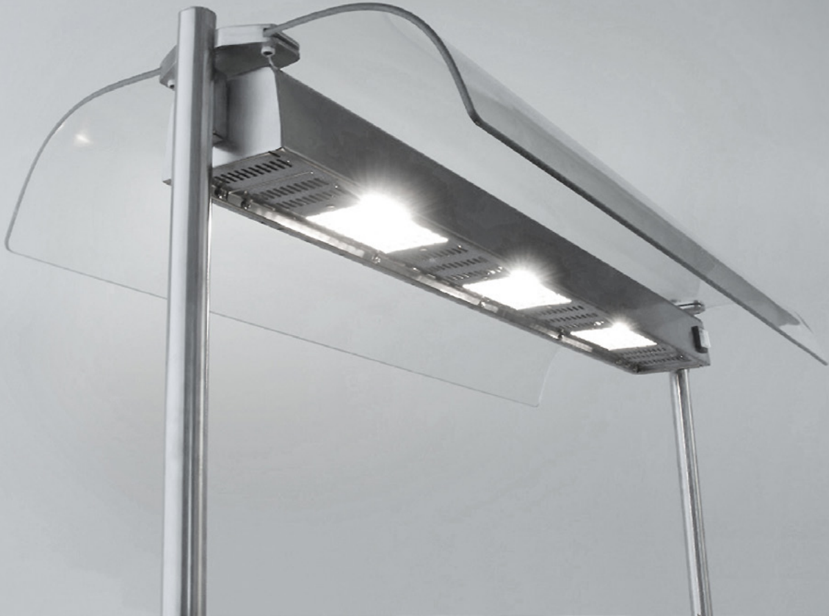
Gantry shown with double glass and overhead heating option

Designed for the Drop-in range, these gantries are available as one or two sided glass units to protect food, and can be equipped with heating elements (for hot units) or lighting (for cold units). European build quality and styling, with round tubular uprights for the most demanding of installations.