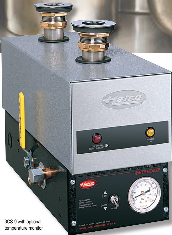
3CS-9 with optional temperature monitor

Maintaining a continuous supply of sanitizing rinse water without taking up valuable space, the 3CS makes manual warewashing faster and more convenient.