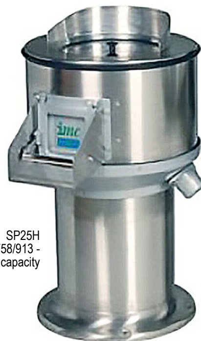
SP25H Model F58/913 - 600Kg/Hr capacity