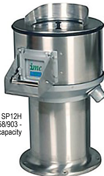
SP12H Model F58/903 - 300Kg/Hr capacity

With a choice of pedestal heights to fit a tank or catering sink, a flexible hose or plumbed-in waste outlet on either side and the option of an integrated filter basket, an SP Peeler fits easily into your working environment.