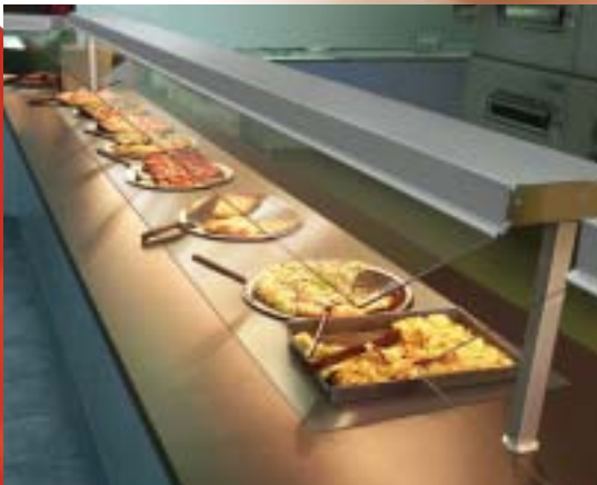
Glo-Ray model GRSBF-72-S drop-in heated shelf with flush top, optional stainless steel surface, and accessory pizza pans