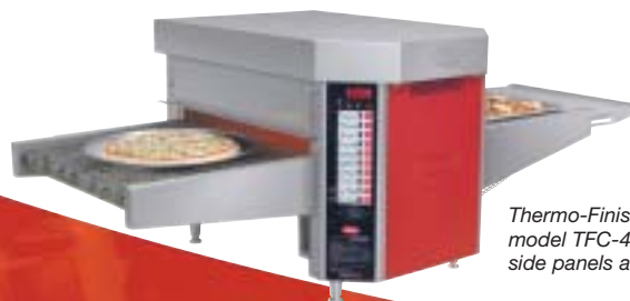
Thermo-Finisher™ conveyor food finisher model TFC-461R with Designer color side panels and accessory food pans