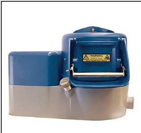
VQ3.5 MODEL - CAPACITY 3.5KG

Includes timer function, suitable for up to 80kg /hr 240V 180W supplied with 10a plug