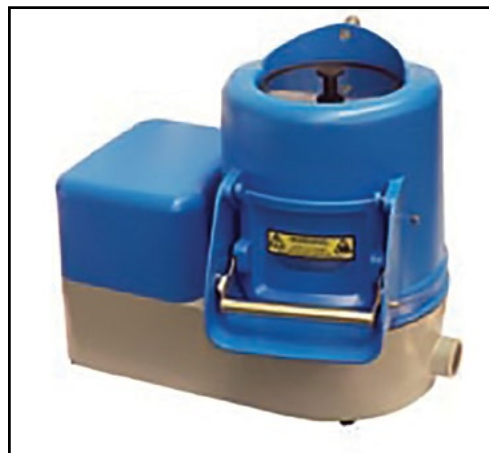
VQ7 MODEL - CAPACITY 7KG

Includes timer function, suitable for up to 80kg /hr 240V 180W supplied with 10a plug