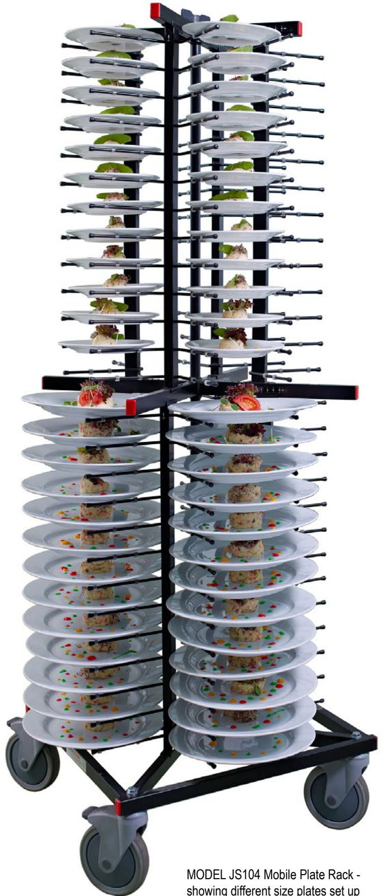
MODEL JS104 Mobile Plate Rack - showing different size plates set up on the upper level.

FSM (FOOD SERVICE MACHINERY PTY. LTD.) HEAD OFFICE: UNIT E6, 63-85 TURNER STREET, PORT MELBOURNE, VIC. 3207 AUSTRALIA T: +61 3 8645 2555 F: +61 3 8645 2565 E: sales@fsm-pl.com.au W: www.fsm-pl.com.au