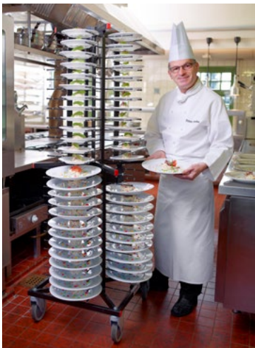
Designed by Chefs and used by Chefs

Totally versatile, the JS104 can accommodate several different size plates at the same time, and can be loaded and unloaded from four sides, and carry 400 empty plates to the dishwasher.