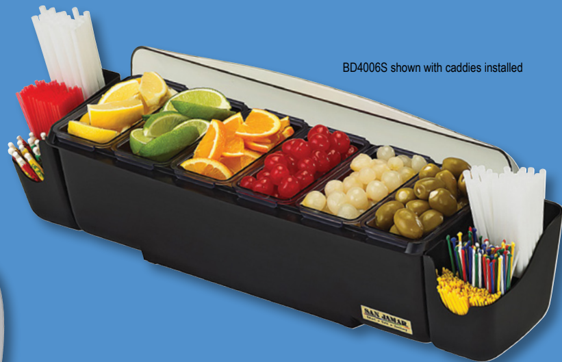
BD4006S shown with caddies installed