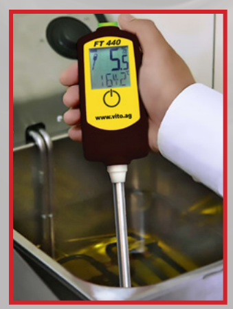
Hands are at maximum safe distance for operator safety whilst in use.