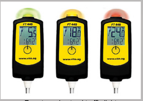
Easy to understand traffic light system for fast checking.