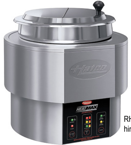
RHW-1 Shown with hinged lid in place