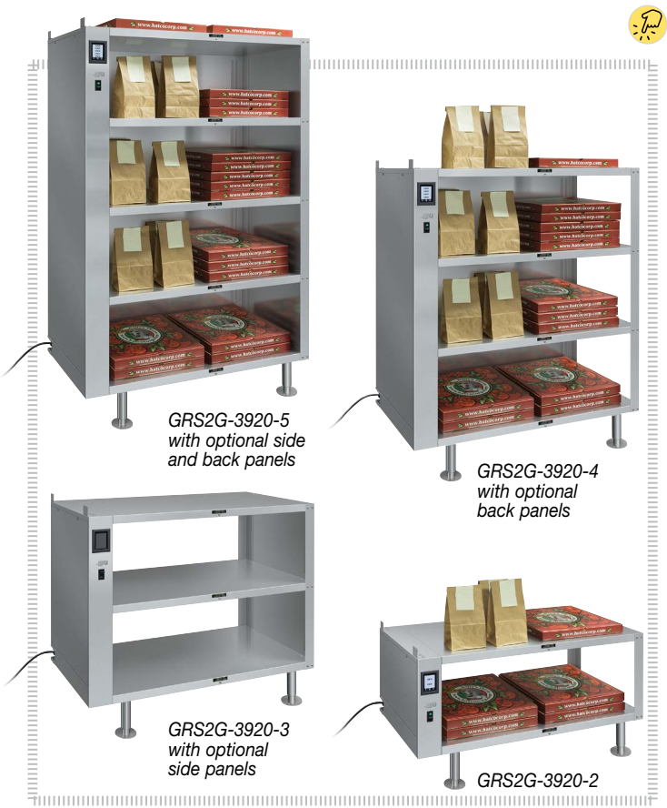
GRS2G-3920-5 with optional side and back panels