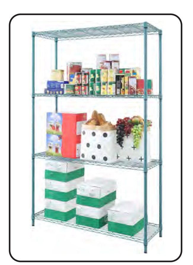
Open wire design allows for ventilation and clear visibility