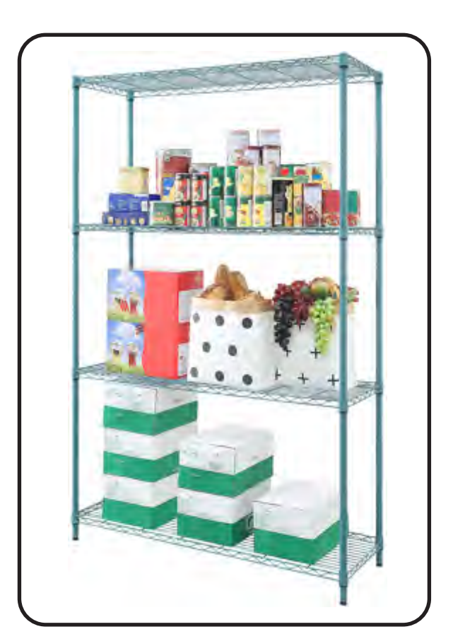
Open wire design allows for ventilation and clear visibility