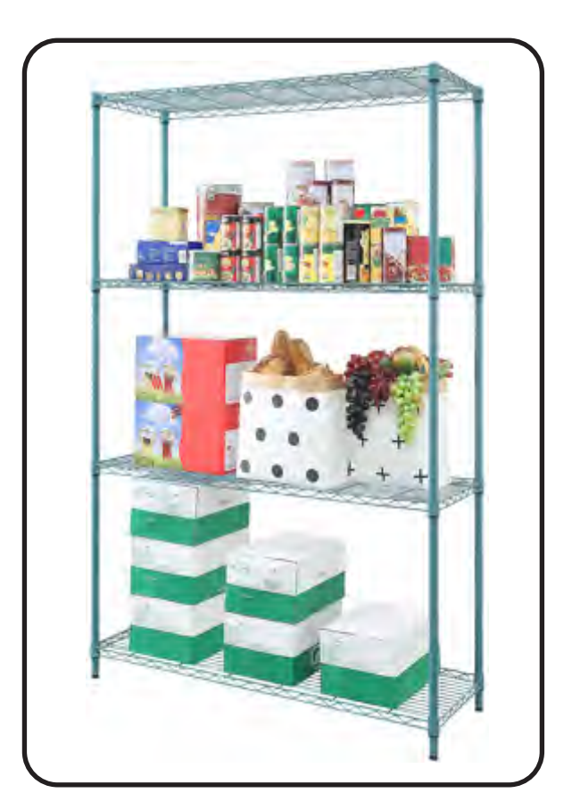
Open wire design allows for ventilation and clear visibility