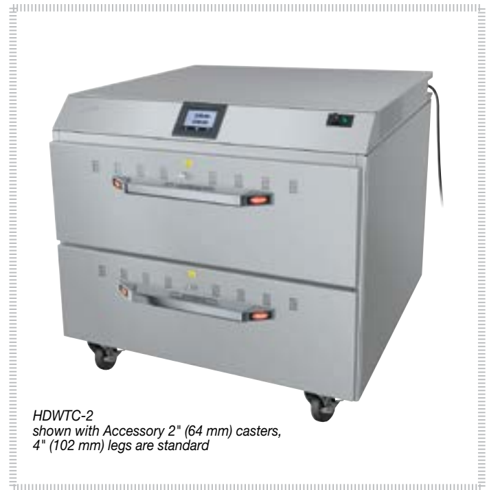
HDWTC-2 shown with Accessory 2" (64 mm) casters, 4" (102 mm) legs are standard