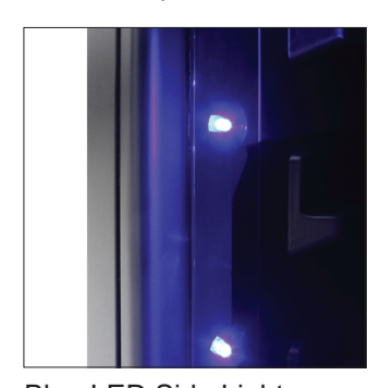
Blue LED Side Lights